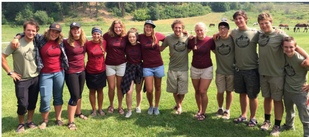
This summer, 9 students from all across Washington, Idaho, and Sweden participated in this leadership development opportunity – dynamic relationships and challenging experiences.

This twelve-day trip is designed for 16-19 year olds transitioning into adulthood who are highly motivated and who are looking to develop more leadership skills.