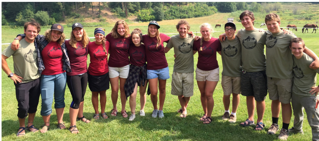
This summer, 9 students from all across Washington, Idaho, and Sweden participated in this leadership development opportunity – dynamic relationships and challenging experiences.

This twelve-day trip is designed for 16-19 year olds transitioning into adulthood who are highly motivated and who are looking to develop more leadership skills.