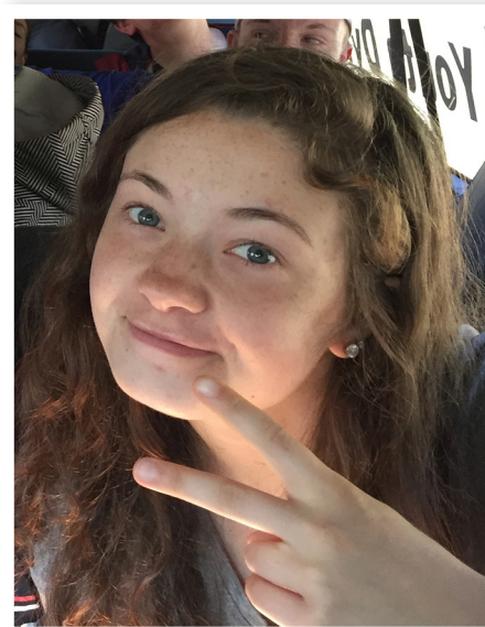
YD Adventure trips help deepen relationships already formed throughout the year through YD Communities.