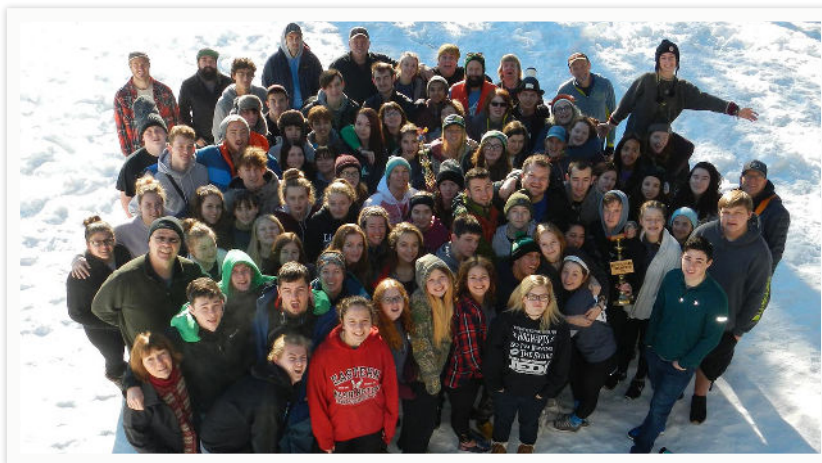
Group photo of the 2019 Hotdoggin' weekend warriors.

It is a gift of God's grace to be a part of His work together.