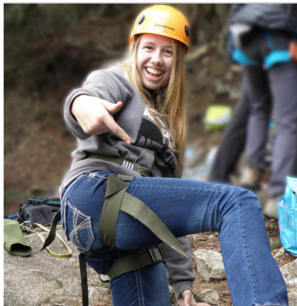
Student leaders are trained up and sent into the mission field.