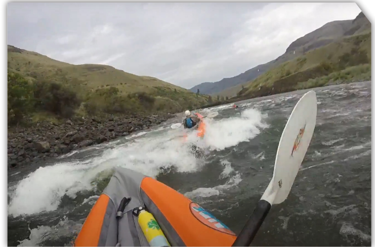
Kayaking down the Salmon River with smaller groups of students this summer provided great opportunity to build relationships and take students outside of their comfort zone.