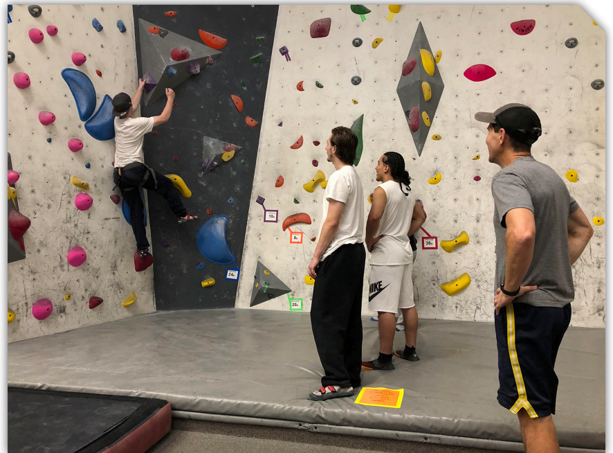
A group from a juvenile transition home finds community and hope during their weekly climbing club hosted by Youth Dynamics staff and volunteers.