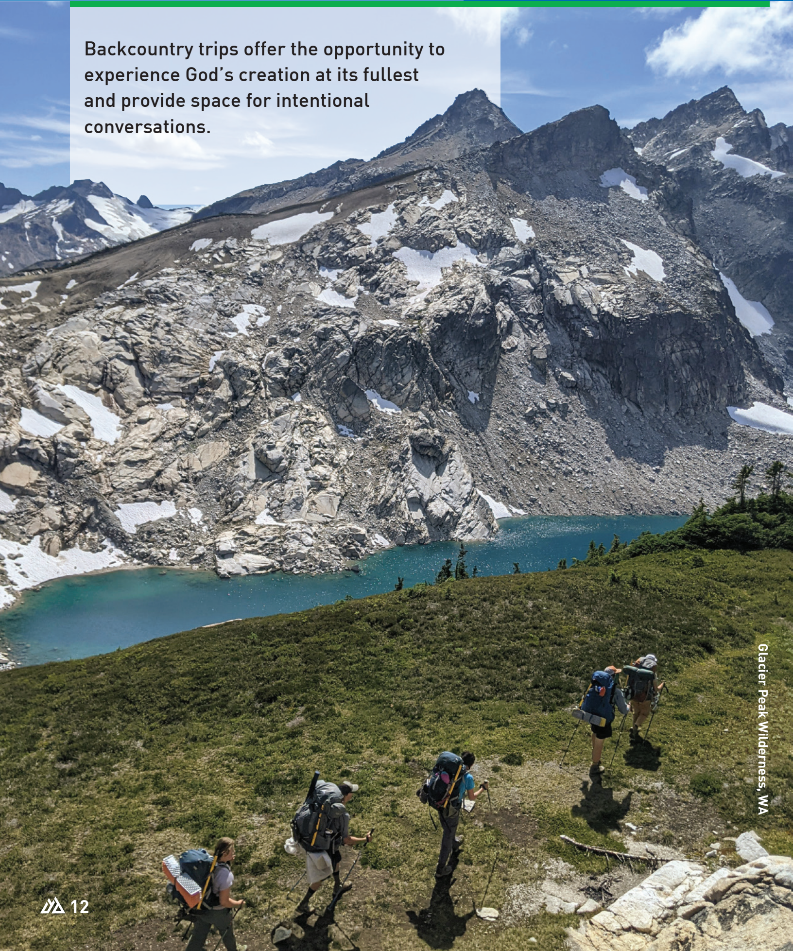
Glacier Peak Wilderness, WA

Backcountry trips offer the opportunity to experience God's creation at its fullest and provide space for intentional conversations.