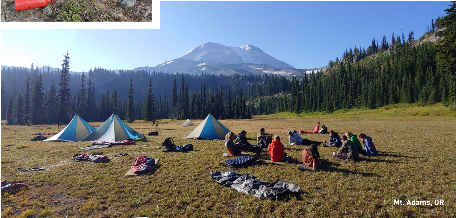
Mt. Adams, OR