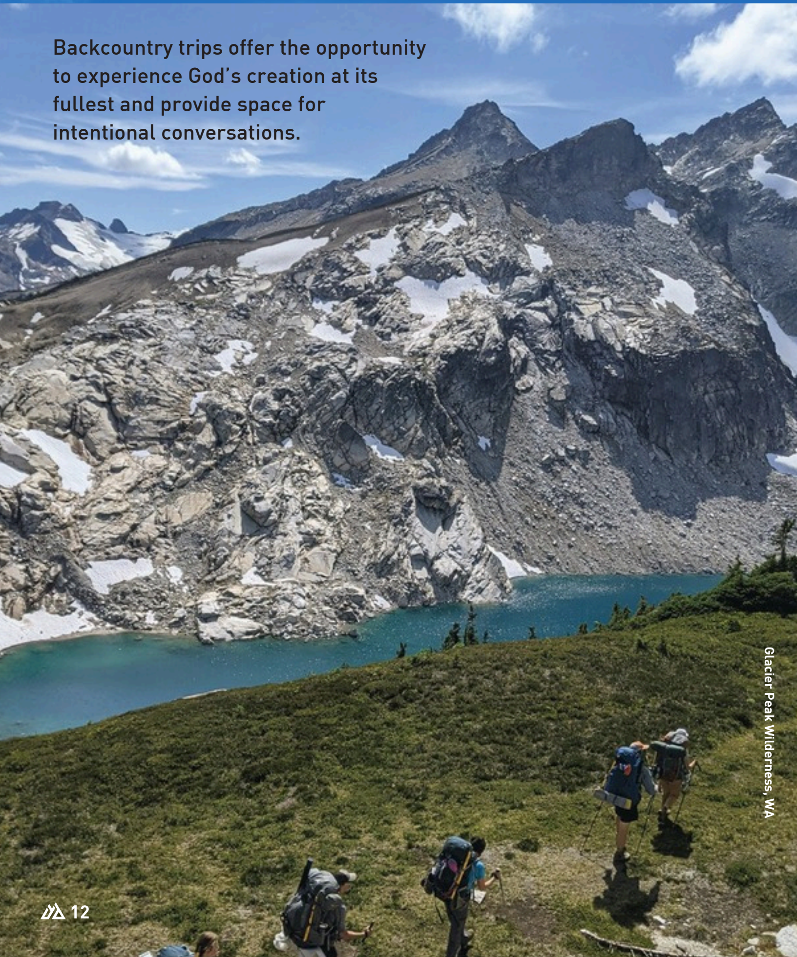
Glacier Peak Wilderness, WA

Backcountry trips offer the opportunity to experience God's creation at its fullest and provide space for intentional conversations.